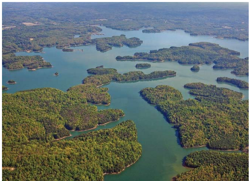
Lake Blue Ridge, a TVA lake with dozens of islands and coves, was created in the 1930's.